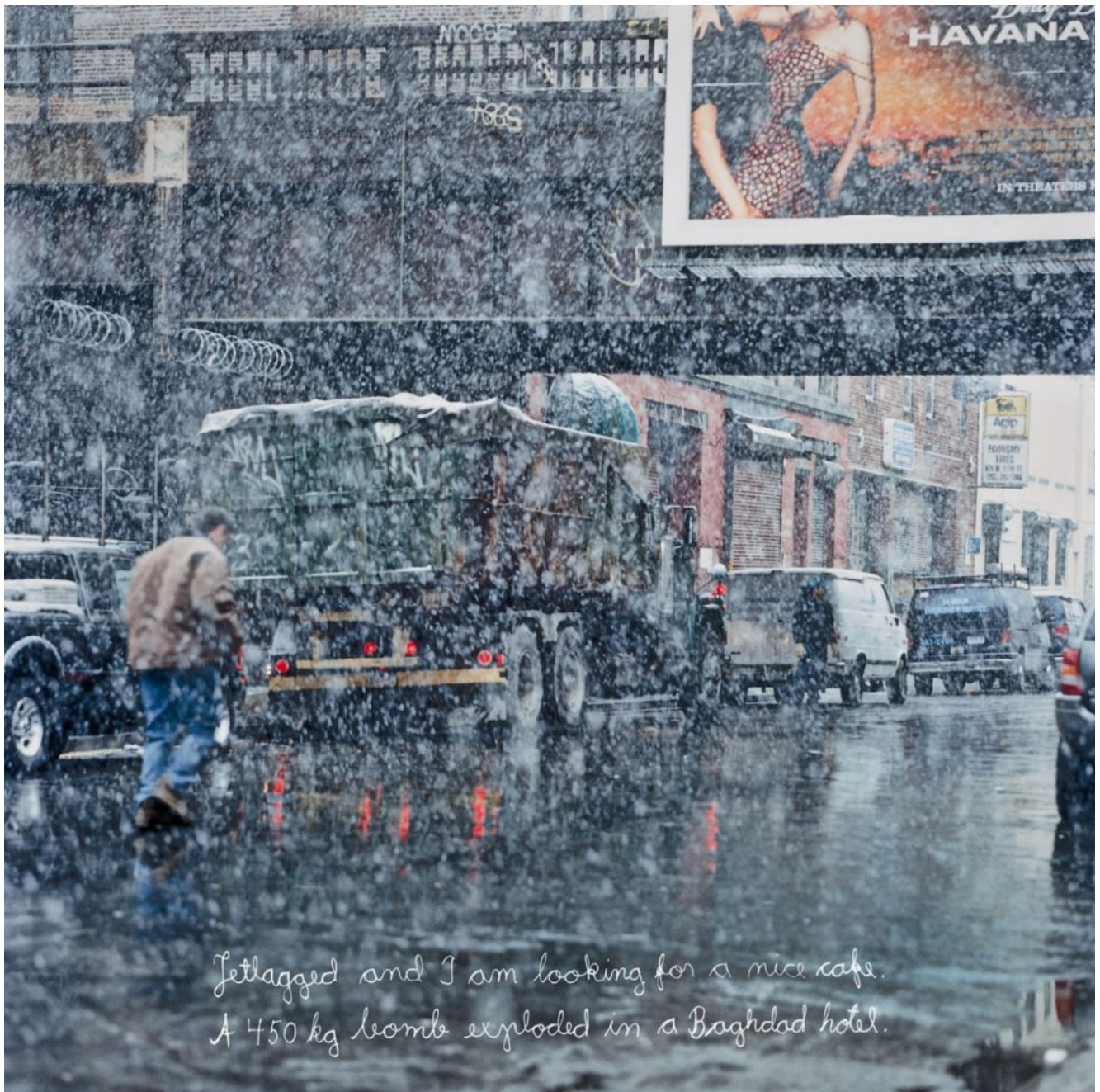
(Finland) "My Weather Diary"