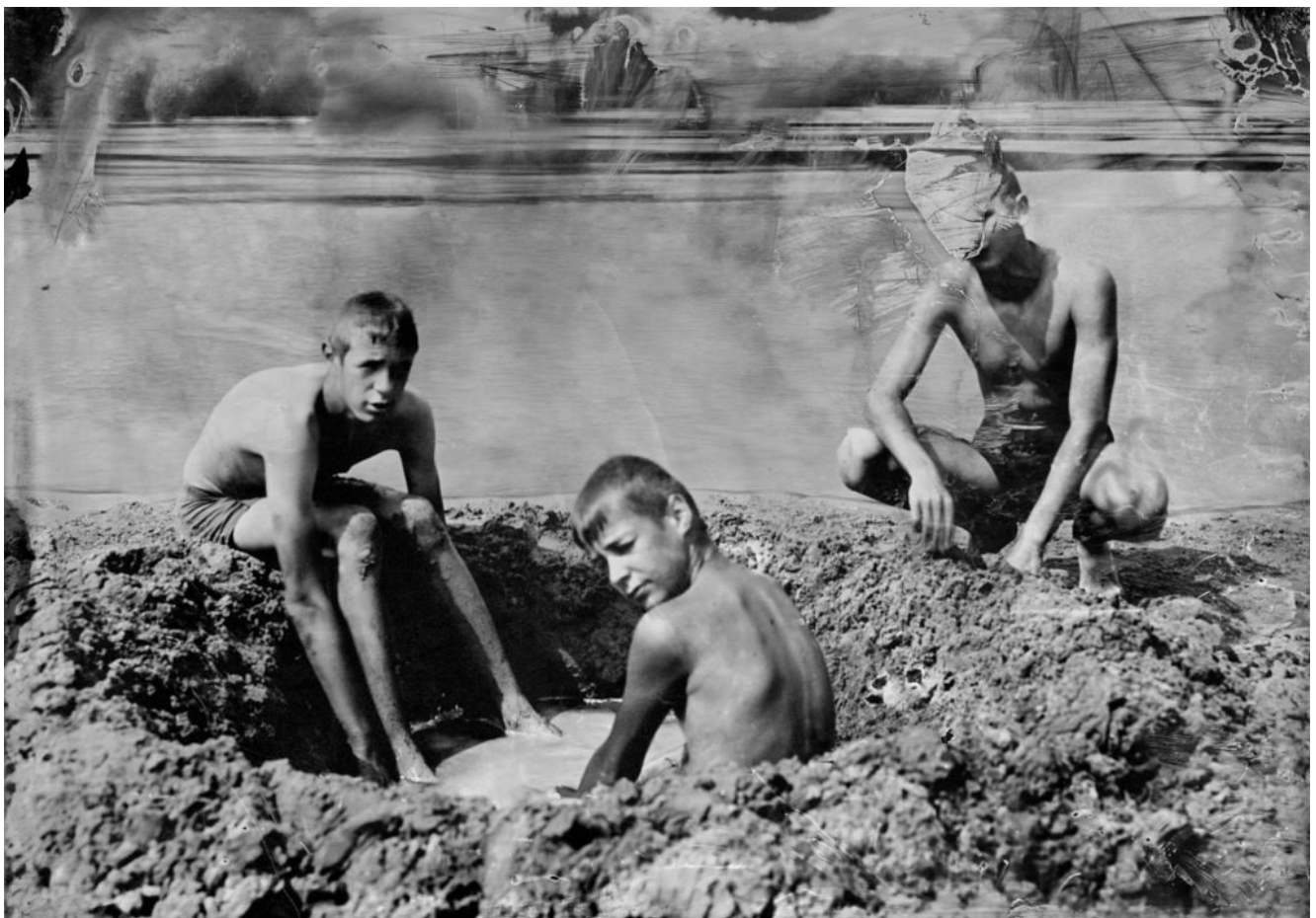
(Poland) "Wonder Year"