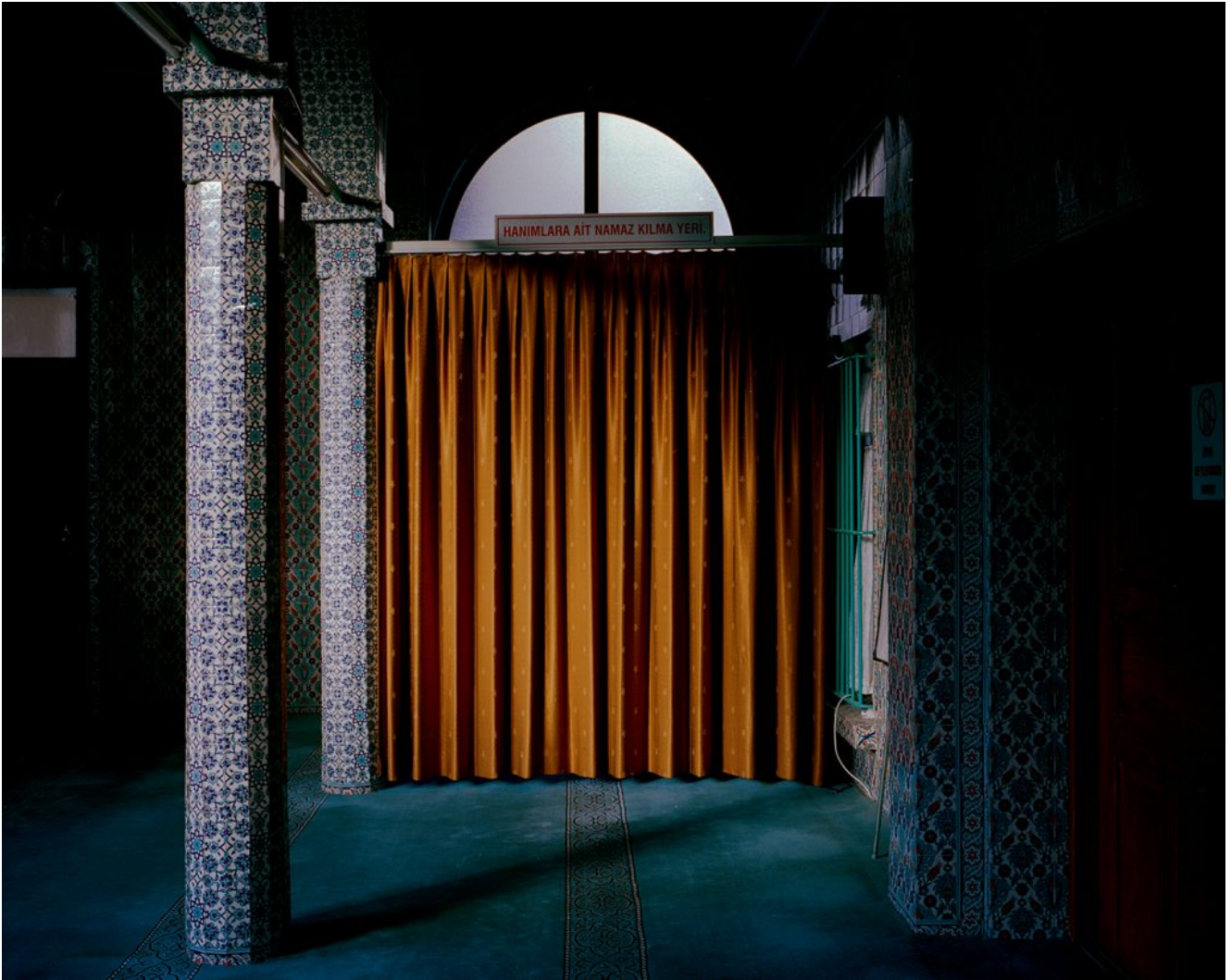
"Stolen Armenian Cemeteries"