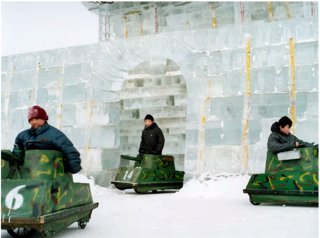
Stephanie Tetu (France) China-Haerbin-Ice sculptur festival, 2003

This project is a follow up at the Formu of Asian and European young photographers (Paris, Maison Europeene de la