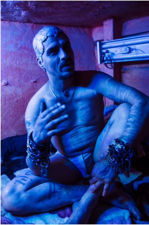
“Inside Outside Under Bucharest”