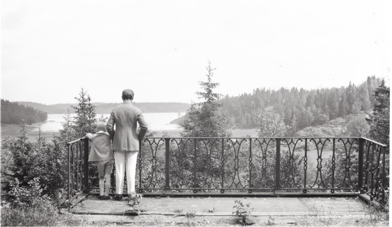
© Lina Scheynius and Ignas Šeinius (Sweden/Lithuania)