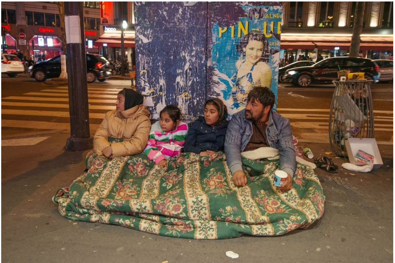
© Vladimir Antaki (France/Canada) "Family Portrait"

Gallery, M. K. Čiurlionis National Museum of Art (Nepriklausomybės sq. 12) in presence of Vladimir Antaki (France/Canada).