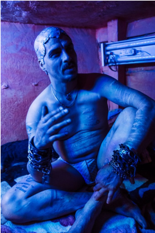
“Inside Outside Under Bucharest”