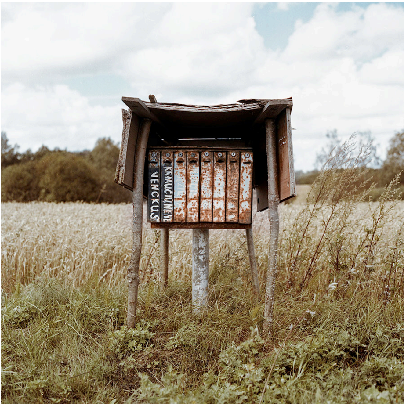
(Lithuania) "Soon to be Gone"